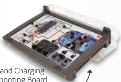
Starting and Charging Troubleshooting Board

4. Hands-on activities for real-world practice using clean, safe equipment for the classroom