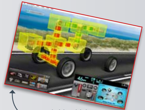
Hybrid Vehicle Simulator