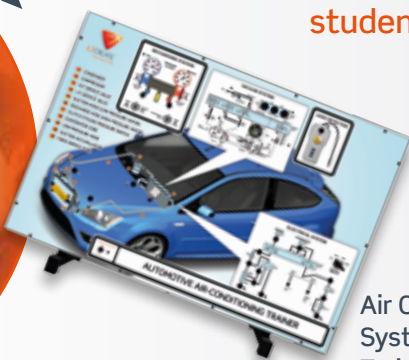
Air Conditioning Systems Panel Trainer

3. Knowledge assessments that test student understanding