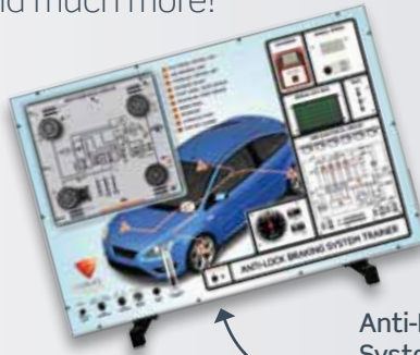
Anti-Lock Braking Systems Panel Trainer