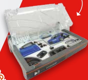
Auxiliary Systems Circuits and Troubleshooting Board

4. Hands-on activities for real-world practice using clean, safe equipment for the classroom