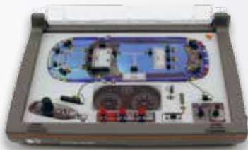
Lighting Circuits and Troubleshooting Board

Our vehicle trainers are clean, safe and provide real-world hands-on skills in the classroom for automotive electronics, starting and charging systems, engine management and much more!